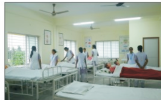
Nursing Foundation Lab