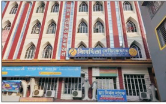
Nibedita Medicare & Diagnostic Pvt. Ltd. Uluberia, Howrah