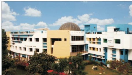
Saroj Gupta Cancer Centre & Research Institute