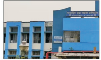
Gabberia State General Hospital