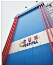
Sun Hospital, Uluberia