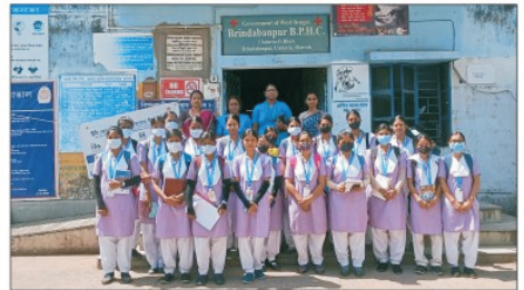
PHC / BPHC