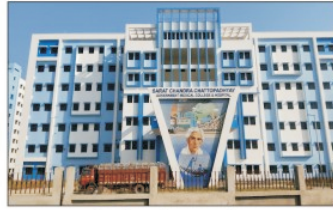
Sarat Chandra Chattopadhyay Govt. Medical College & Hospital, Uluberia